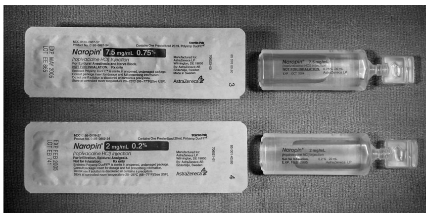
Fig. 1. Illustration of two concentrations of ropivacaine. Note the nearly identical appearance of both the ampule and package of each concentration.

(Accepted for publication April 18, 2004.)