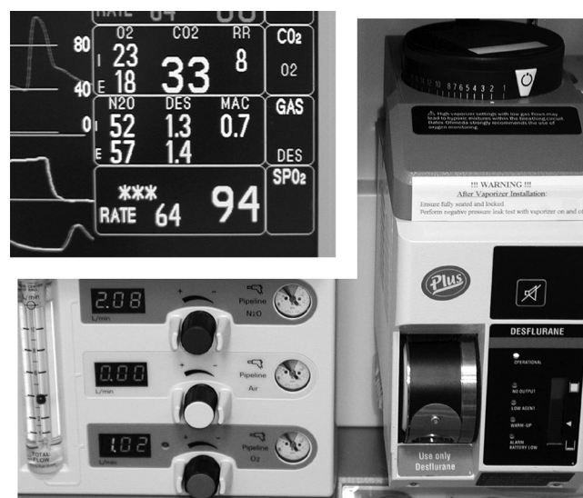
Fig. 1. Anesthesia machine settings during the event described. Inset shows contemporaneous gas analyzer readings. The difference was due to room air entrained through a large hole in the breathing bag.

breathing bag. The breathing bag was quickly replaced, the circuit was successfully pressure-tested, and mechanical ventilation and delivery of anesthetics were resumed. Thereafter, gas monitor values were consistent with machine settings. Afterwards, the patient denied recall of intraoperative events.