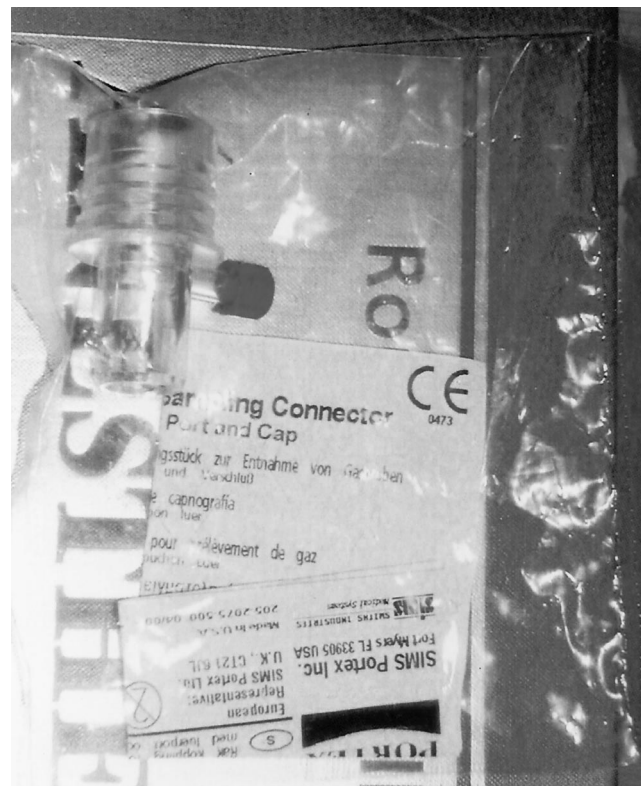
Fig. 2. Straight gas sampling connector (SIMS Portex) in its original plastic packaging.