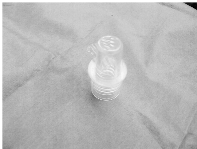
Fig. 1. Straight gas sampling connector (SIMS Portex) with plastic packaging forming an obstructive membrane.

After numerous failed attempts to acquire a Reply to this Letter, it is being published without a response. —Michael M. Todd, Editor-in-Chief.